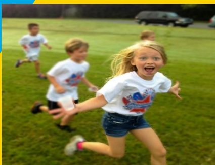
Learning to love PE!

Due to these unprecedented times, this is how we are allowing you to partake in the Boston and District School Sport Partnership